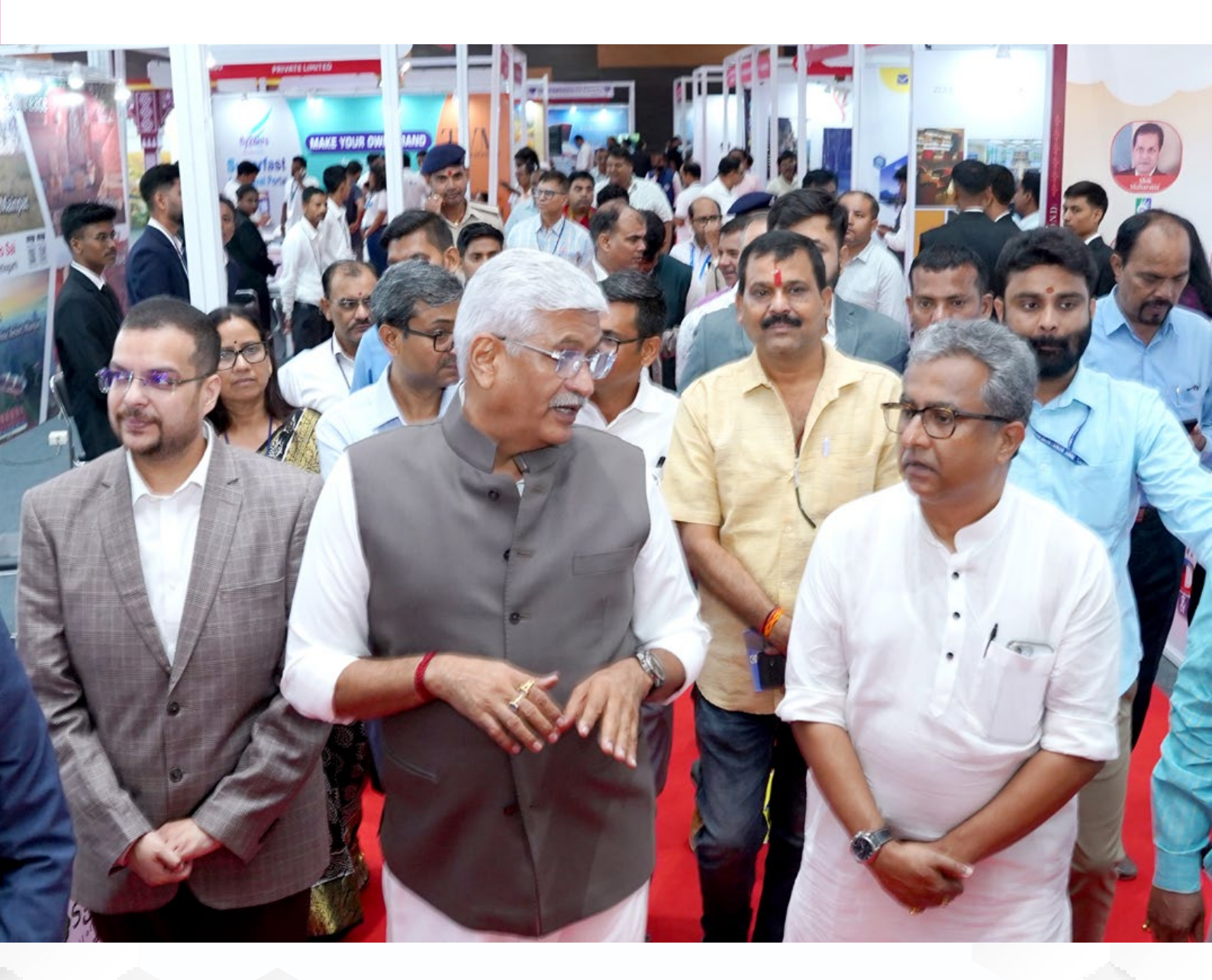
Shri Gajendra Singh Shekhawat, Hon'ble Tourism Minister, Govt. of India