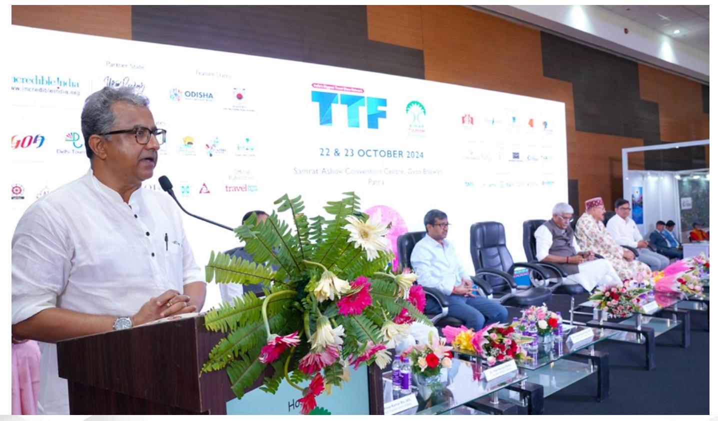
Shri Nitish Mishra, Hon'ble Minister for Industries and Tourism, Govt. of Bihar